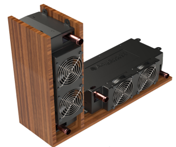
Heat exchangers can be placed vertical or horizontal.